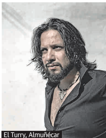
El Turry, Almuñécar

FUENGIROLA. Mondays to Fridays, 10am - 1pm. Lux Mundi Ecumenical Centre, C/Nueva 3.