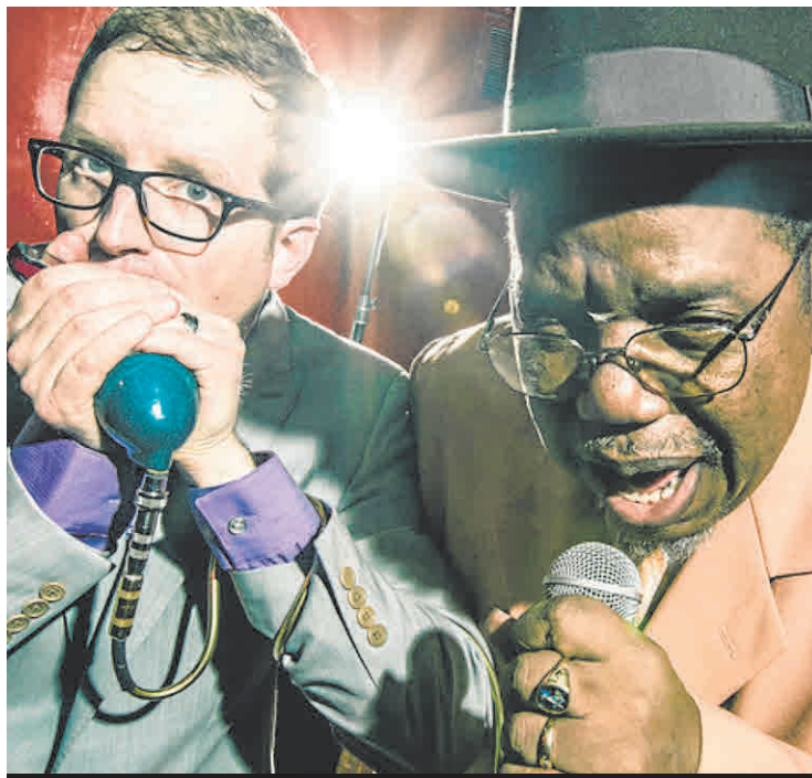
The Cash Box Kings bring their 1920s Delta Blues to Torremolinos.

Among this year's line-up are The Delta Bombers, a Las Vegas rockabilly band founded in 2008; The Cash Box Kings, famed for their 1920s Delta Blues style; The Slink Moss Explosion, a high- energy rock and roll quartet from Chicago's south side that meld various influences from the 1950s and new